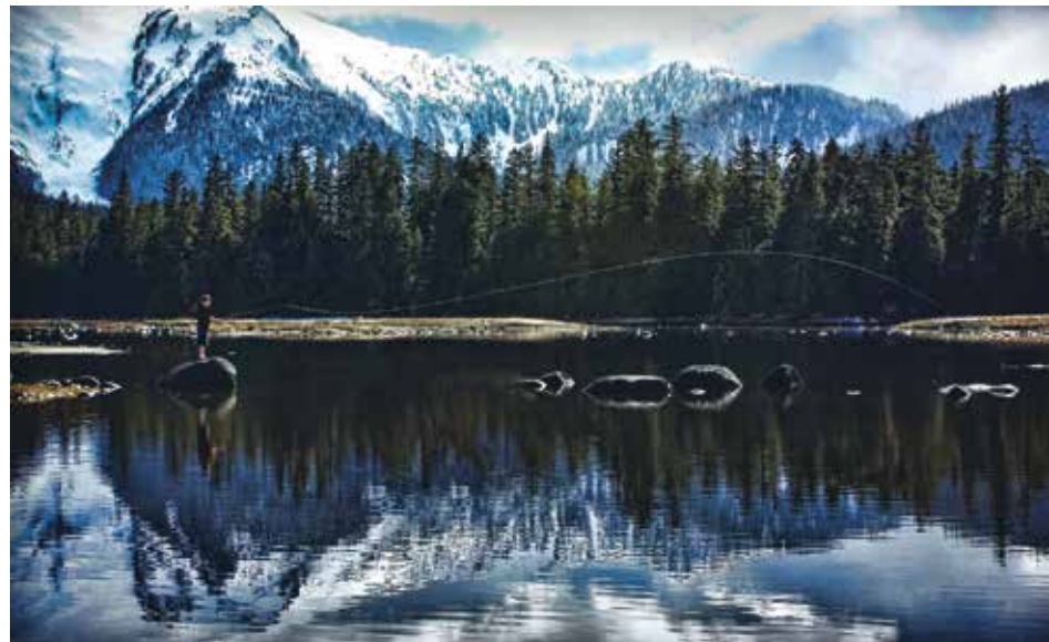
Mandy Kivisto Petersburg, Alaska A boy casts a fishing line gracefully across a lake near Petersburg, Alaska.