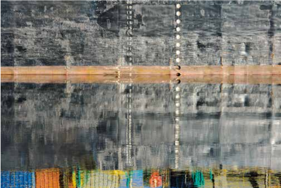
William Hughlett Seattle, Washington A ship hull is reflected in waters along Terminal 91 in Seattle.