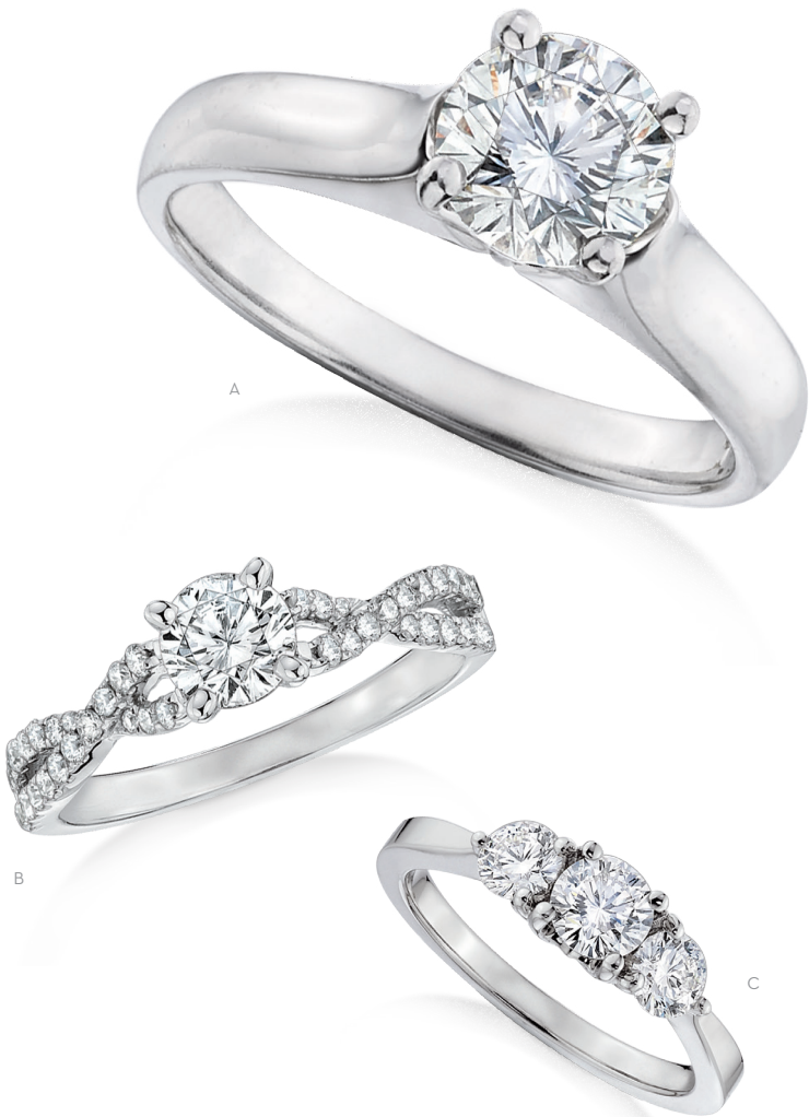
A Signature Diamond solitaire ring in platinum, 1 ct. $13,999 #886325 B Signature Diamond ring, 1 ct. t.w. $3999 #11109485 C Signature Diamond ring, 1 ct. t.w. $4999 #11080215