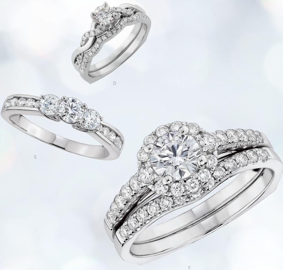
D Ikuma diamond bridal set, 5/8 ct. t.w. $2999 #11158565 E Ikuma diamond ring, 3/4 ct. t.w. $1999 #11088432 F Ikuma ideal cut diamond bridal set, 1 ct. t.w. $4999 #11158607