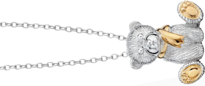
Benny Bear pendant in sterling silver & 14K yellow gold plating $79